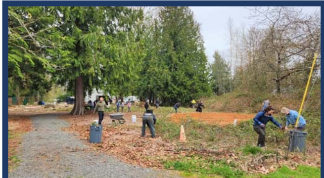
Recognizing Earth Day at Eagle Ridge Park

The $69.5 million project will improve this intersection by adding four roundabouts and widening SR 9 to two lanes in each direction immediately south of the SR 9/SR 204 intersection. By dispersing traffic across the four roundabouts, the project will improve traffic flow, trip reliability, freight movement, safety, and access to local businesses. The project will also improve transportation connections for pedestrians, bicyclists, transit riders, and drivers.